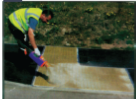
9 Broadcasting kiln dried sand