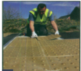
8 Applying tiles