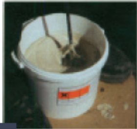
5 Mixing adhesive