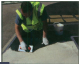
7 Screeding adhesive