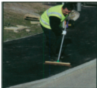
1 Surface preparation