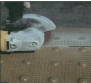
3 Cutting tiles