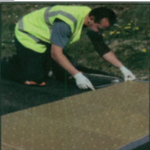
4 Applying duct tape

DO NOT INSTALL TILES DIRECTLY ONTO NEWLY LAID ASPHALT OR CONCRETE (ASPHALT NEEDS TO BE MATURED FOR AT LEAST 7-10 DAYS PREFERABLY FOR 1 MONTH BEFORE APPLICATION) DO NOT INSTALL IN AIR TEMPERATURE BELOW 5°C OR ABOVE 40°C