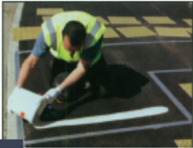
6 Pouring adhesive